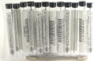
Part ID- 81AMMKIT